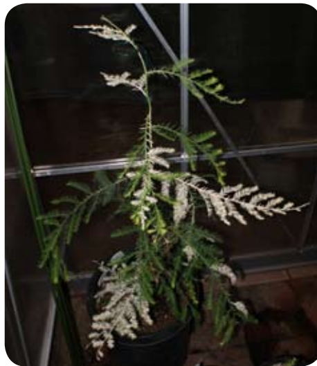
Patent USPP26573: Coast redwood 'Mosaic Delight'